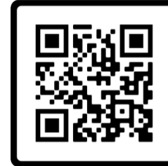
JAMIE KNIGHT FREESTYLE FOOTBALL